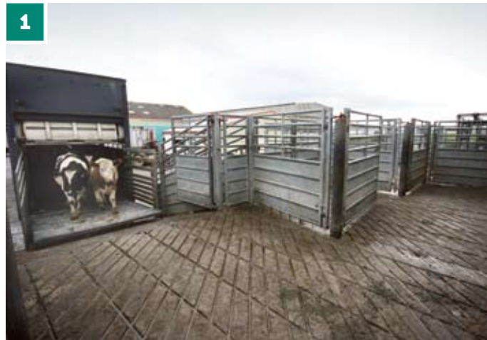
Cattle unload themselves as the tail-board lays flat on the floor.